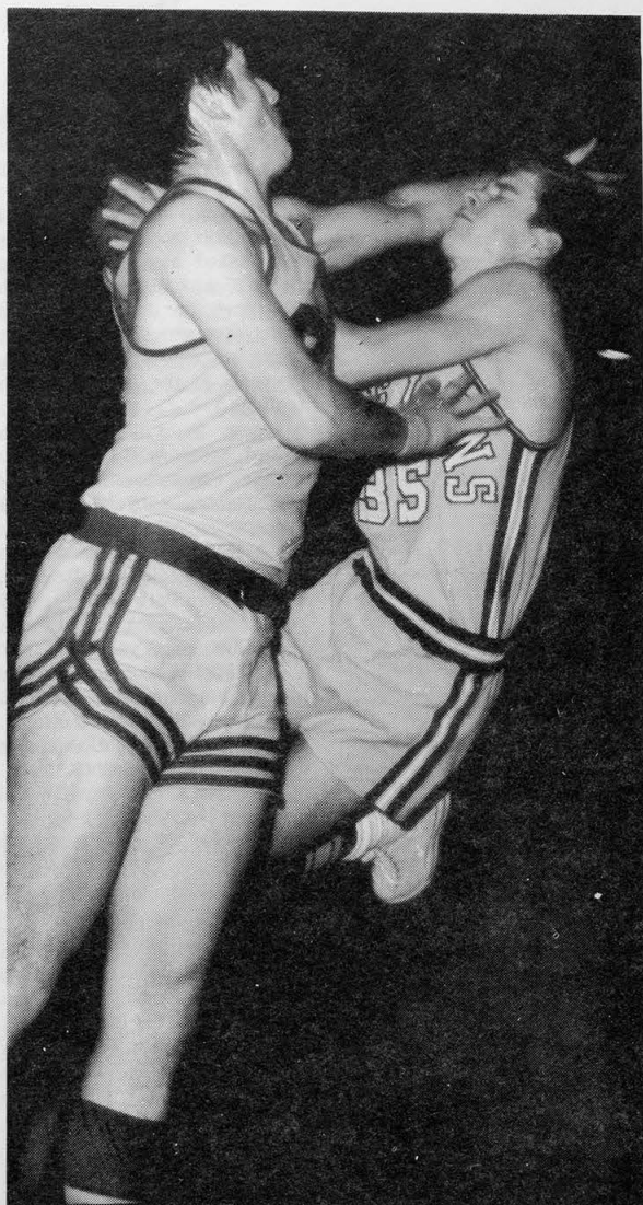
WOULD YOU call this a foul?