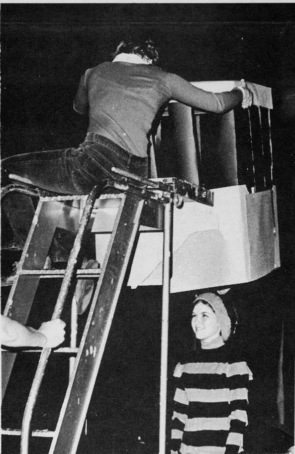
JUNIORS DROP the trap on tiger Robin Hood during their skit.

Girls' League is an organization which is open to all girls. The club gives the girls a chance to work on projects throughout the year, and become better acquainted with students, school and community. Various activities for the year are Powder Puff Football, Carol Contest, Val-O-Grams, Papa Party, and Mothers Day Tea.