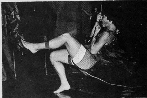
A SOPHOMORE jungle-man swings out during their skit at the rally.