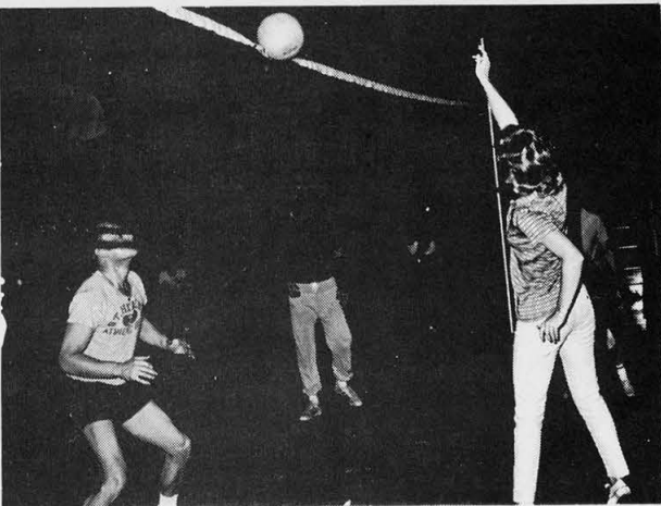
MEN AND WOMEN faculty members hash it out during the faculty volleyball game.

ST. HELENS NURSING CENTER 75 Shore Drive 397-2713 One of Oregon's newest and finest facilities